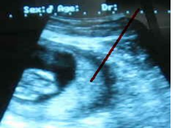
Figure1: Ultrasound guided collection of chorionic villous sample

diagnostic procedure, possible outcomes of the test and the chances of misdiagnosis . After appropriate counselling of the couples, placental sample was taken under local analgesics with suction cannula by transabdominal approach. Every patient was placed in supine position and placenta was localized by transabdominal ultrasonography. Needle was inserted using free hand technique under ultrasound guidance. Needle was advanced at an angle that allowed it to penetrate along the long axis of placenta . Stillet was then removed. Fifty c.c disposable syringe was mounted on holder and the holder was attached to the hub of the needle (Figure 1). The needle tip was removed back and forth inside the placenta applying a continuous suction until an adequate sample had been aspirated (5-10 mg of chorionic villous was needed). The sampling system was then withdrawn under negative pressure .Chorionic villous sample was dissected under a stereo-microscope . Maternal tissue, if any, was carefully separated and placental villi were proceeded for further DNA analysis. The parents' blood samples and CVS were tested for ßthalassaemia mutations , found in Pakistani population by a Multiplex Amplification Refractory Mutation System (ARMS). Each PND was carried out by including the parents DNA, fetal DNA for the mutation, as well as the normal gene, appropriate negative and positive controls and reagent blanks.