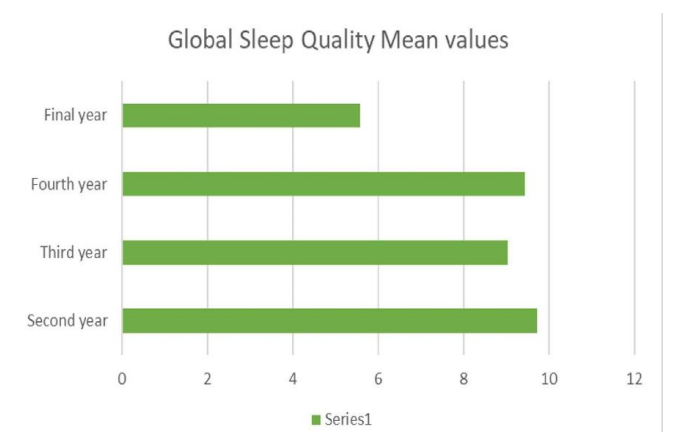
Figure-2 Mean values of global sleep quality among different years of study

A spearman rho test was applied between seven domains of quality of sleep and Global Sleep Quality, and moderate-severe distress (defined as DA23SS D ≥7, DASS-A ≥5, DASS-S > 9). It was found that there was a positive correlation between moderate distress and subjective sleep quality, sleep latency, sleep duration, sleep disturbances, daytime dysfunction over the last month, and global sleep quality. Table III shows correlation between quality of sleep and moderate-severe distress.