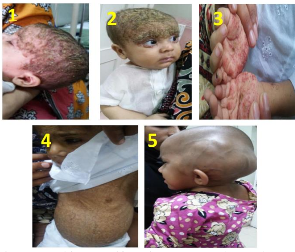
Fig 1-4: Skin manifestations on scalp, palms and abdomen; Fig 5: CNS-Risk Lesion on Parieto-Occipital Region