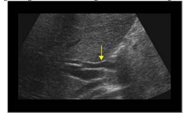
Fig 2: Longitudinal section of a normal calibre bile duct common bile duct