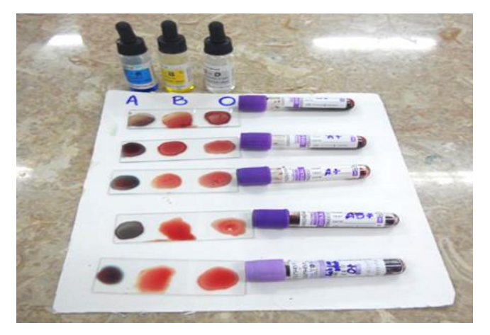
Figure 2: Blood groups tested using the hemagglutination method.