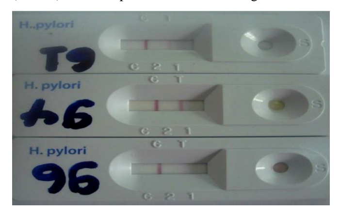
Figure 1: Screening of H. pylori IgG antibodies using rapid test kits.

In the current study, 150 total samples between the age group of 18-60 years were involved in the study and were tested for H. pylori infection, among them 55.3% (83/150) were seropositive as shown in Figure 3.